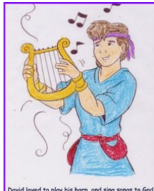
David loved to play his harp, and sing songs to God.